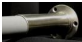
Sleeve on Floor to Ceiling Bar