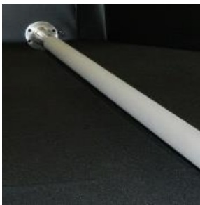
Floor to Ceiling Bar

Floor to Ceiling Bar is a straight bar with no bends. One end has a four hole flange washer welded and the other end has an adjustable sleeve for easier installation. A Floor to Ceiling Bar is a Custom bar and is available in our Grip Tight™ finish up to 64" long, other finishes are available in this bar. These type of bars are installed in a variety of areas; showers, closets, hallways and floor to ceiling. Each bar includes stainless steel screws and individually boxed.